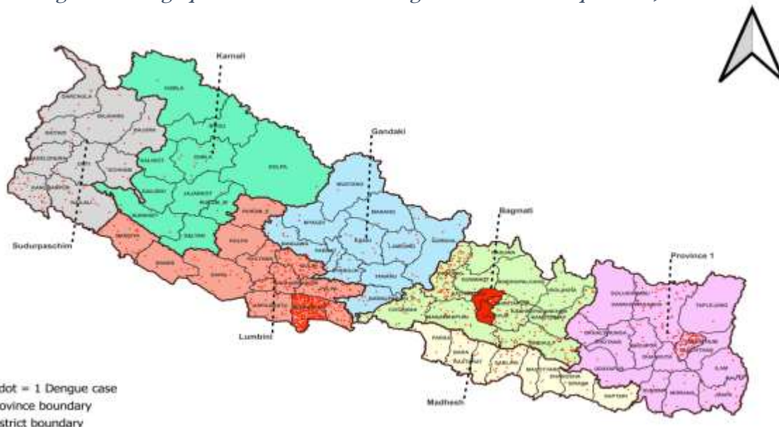
Figure 2: Geographical distribution of dengue cases as of 2 September, 2022